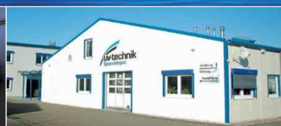
raesch uv-technik speziallampen