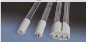
aladin eleco panacol-efd